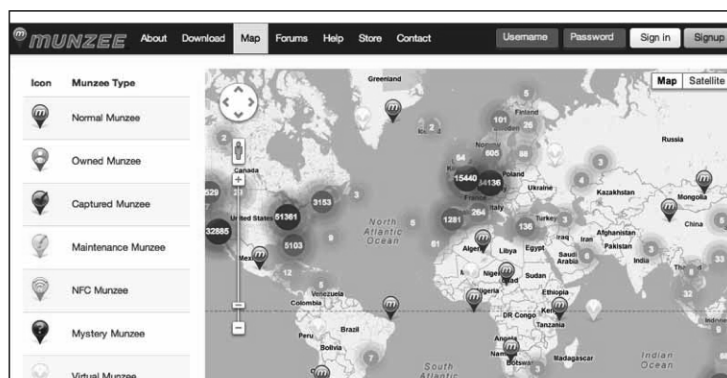
Munzee can be played all over the world!